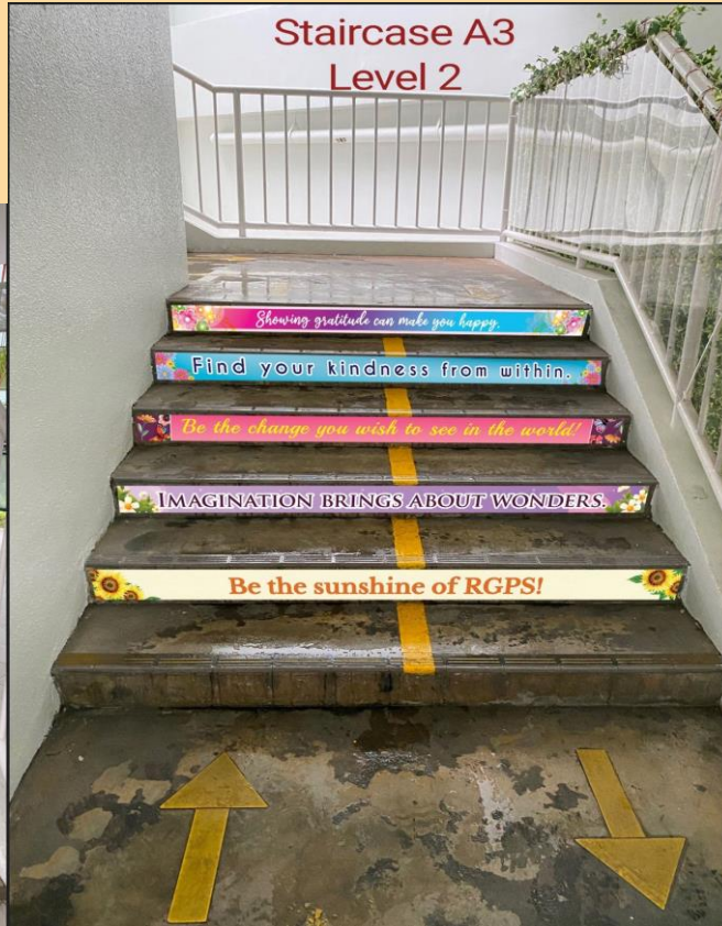
Staircase A3 Level 2